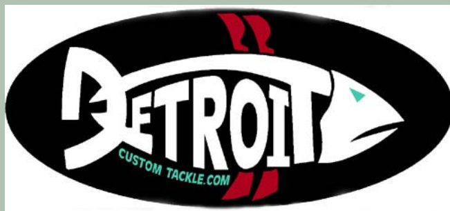
Eric Woodhouse '91 - Co-Owner